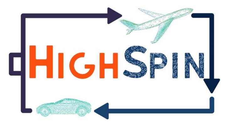
Figure 2: HighSpin project logo.

The project logo is the main visual element: