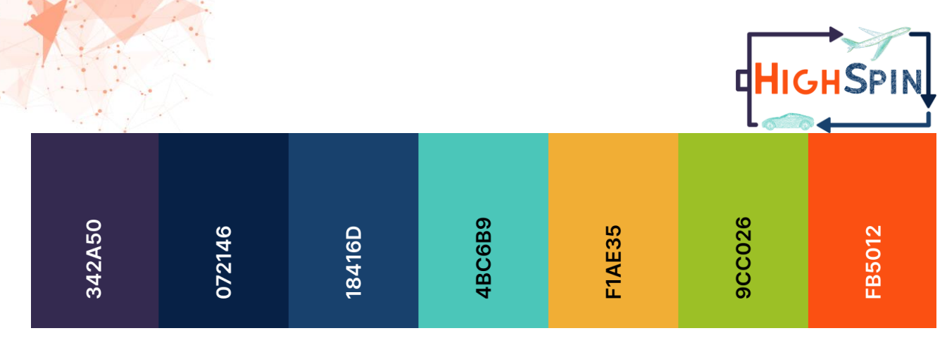
Figure 3: HighSpin colour palette (example figure)